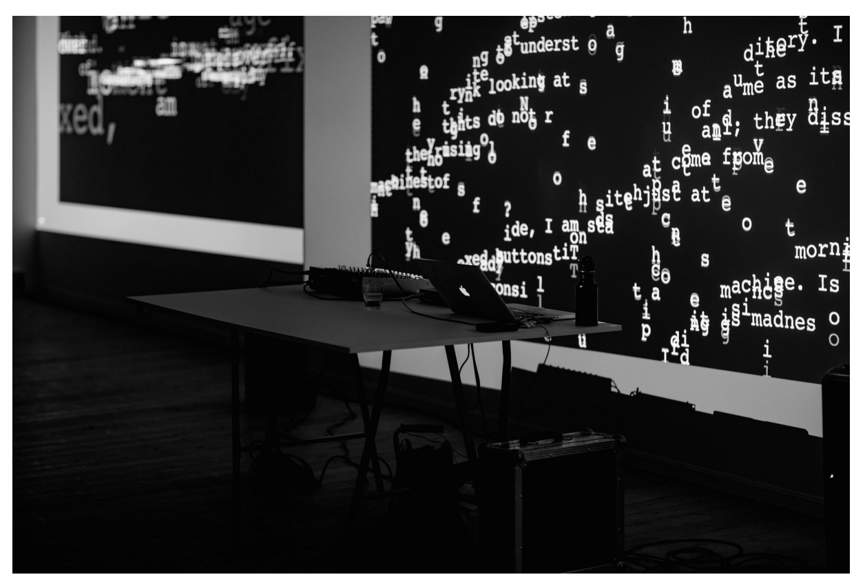
Exile and Other Syndromes.

An exhibition from Exile and Other Syndromes project that responds to urban migration, placelessness, and nomadism – impulses of a contemporary condition that blurs the boundaries between the digital and the corporeal, between local and the global, between private and public domains, or between intimate and dehumanizing spaces, helping the nomadic subject to emerge as an elevated, emancipated self. The project intends to examine these contemporary realities manifesting in an interactive and generative installation incorporating multi-channel sound diffusion and modulated text as multi-screen live visualization of field recordings to create a discursive situation.