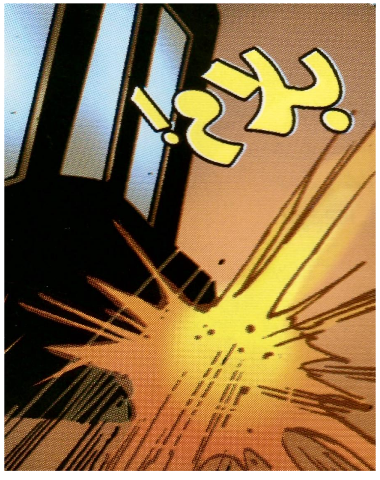
Detail from Conceptual Manifestation

This work is simultaneously something, and nothing. A grouping of visuals from comics found in Egypt have been enlarged and subtly altered, focusing on onomatopoeiac arabic text. The depictions of violence, intended primarily for the consumption by the youth, have been taken out of their original context and put into a new ambiguous one. The addition of wooden handles transform what would normally be posters into protest signs (meant for performance). Could a silent protest, only connoting noise, take place? And if so, what are the connotations of such an action in a solo or group context? What might it mean to use the form of protest conceptually exactly where the Revolution took place some ten years ago?